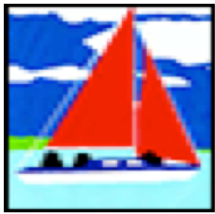
Disabled Sailing Association